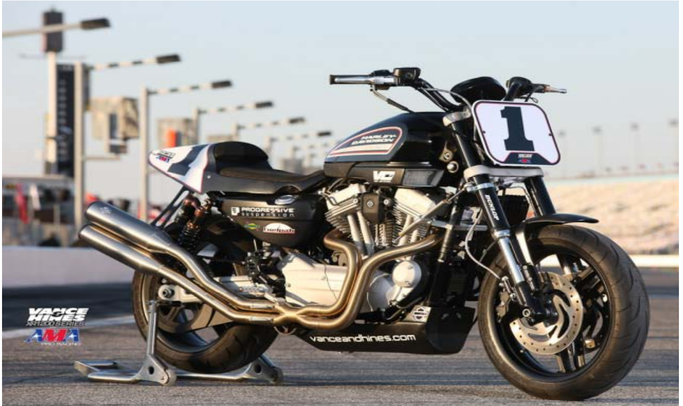
New Harley-Davidson XR1200 Spec motorcycle standard black.