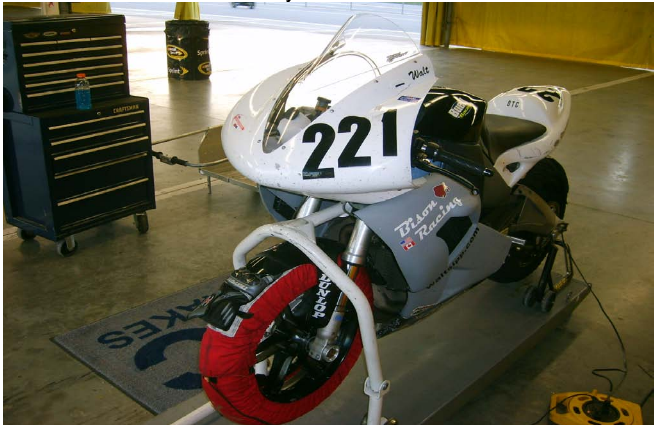
Walt Sipp's unsponsored #221 Buell 1125R Daytona Sportbike on the starting grid at Daytona!